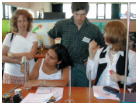
A practical session in the Science for Society course