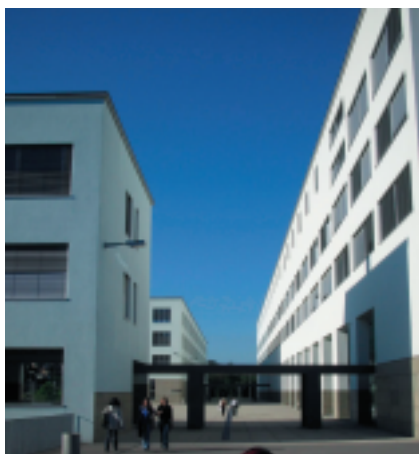
EPFL Lausanne

Although it is open to our undergraduates to participate in the exchange with MIT that started under the auspices of the Cambridge-MIT Institute, it is not possible for them to spend a year in Europe under the ERASMUS scheme.