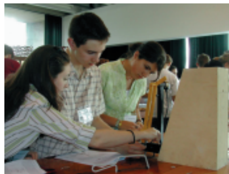
Participants in the Headstart programme investigating fracture toughness